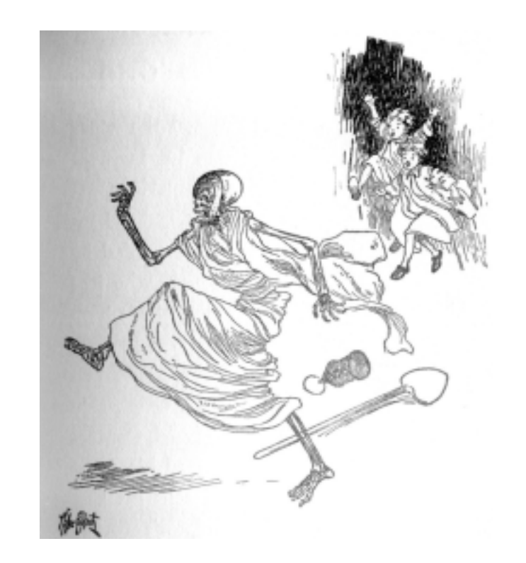
"Suddenly there leaped out two figures."

of the blood-stain, suddenly there leaped out on him from a dark corner two figures, who waved their arms wildly above their heads, and shrieked out "BOO!" in his ear.