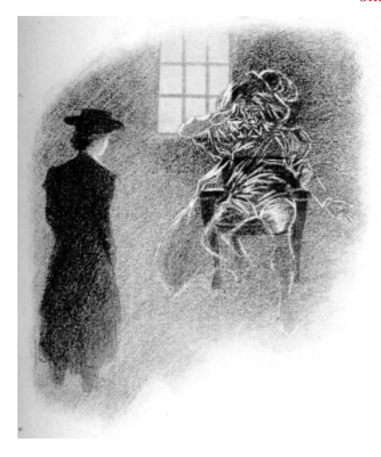
"'Poor, poor ghost,' she murmured; 'have you no place where you can sleep?'"

"Far away beyond the pine-woods," he answered, in a low, dreamy voice, "there is a little garden. There the grass grows long and deep, there are the great white stars of the hemlock flower, there the nightingale sings all night long. All night long he sings, and the cold crystal moon looks down, and the yew-tree spreads out its giant arms over the sleepers."