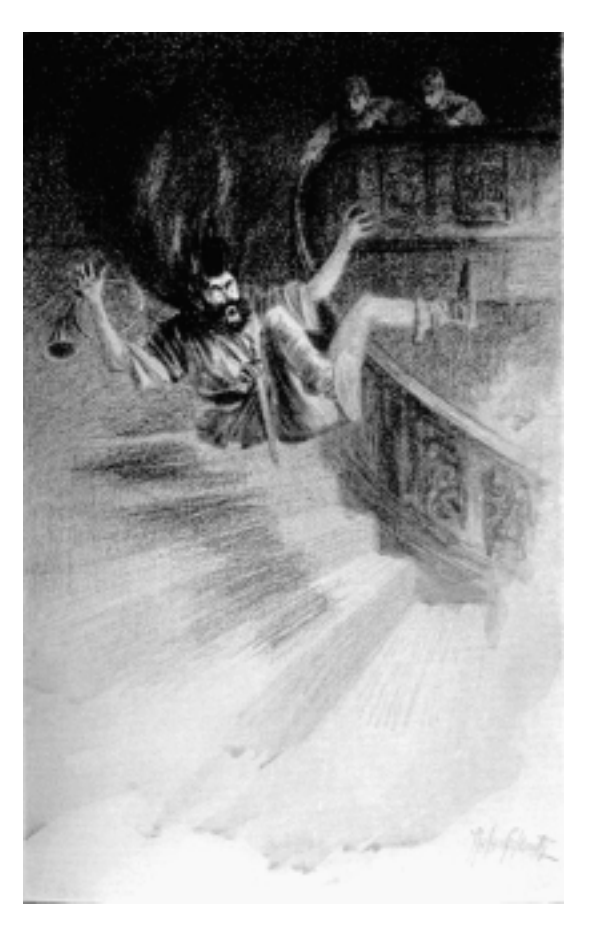
"He met with a severe fall

THE NEXT DAY the ghost was very weak and tired. The terrible excitement of the last four weeks was beginning to have its effect. His nerves were completely shattered, and he started at the slightest noise. For five days he kept his room, and at last made up his mind to give up the point of the bloodstain on the library floor. If the Otis family did not want it, they clearly did not deserve it. They were evidently people on a low, material plane of existence, and quite incapable of appreciating the symbolic value of sensuous phenomena. The question of phantasmic apparitions, and the development of astral bodies, was of course quite a different matter, and really not under his control. It was his solemn duty to appear in the corridor once a week, and to gibber from the large oriel window on the first and third Wednesdays in every month, and he did not see how he could honourably escape from his obligations. It is quite true that his life had been very evil, but, upon the other hand, he was most conscientious in all things connected with the supernatural. For the next three Saturdays, accordingly, he traversed the corridor as usual between midnight and three o'clock, taking every