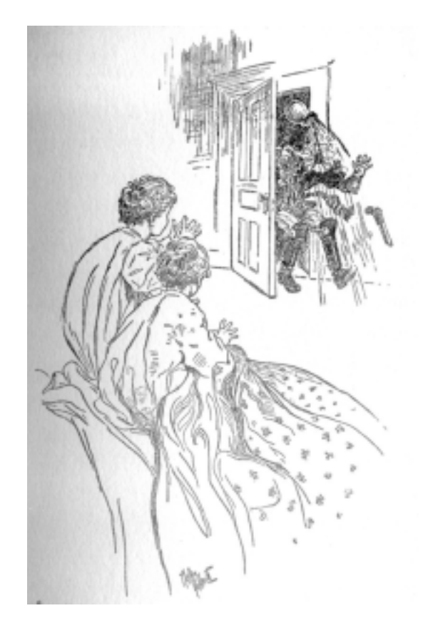
"A heavy jug of water fell right down on him."

the next night in his celebrated character of "Reckless Rupert, or the Headless Earl."