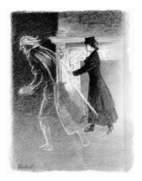
"The ghost glided on more swiftly"

she felt something pulling at her dress. "Quick, quick," cried the Ghost, "or it will be too late," and in a moment the wainscoting had closed behind them, and the Tapestry Chamber was empty.